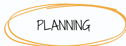
Example for a regular week :